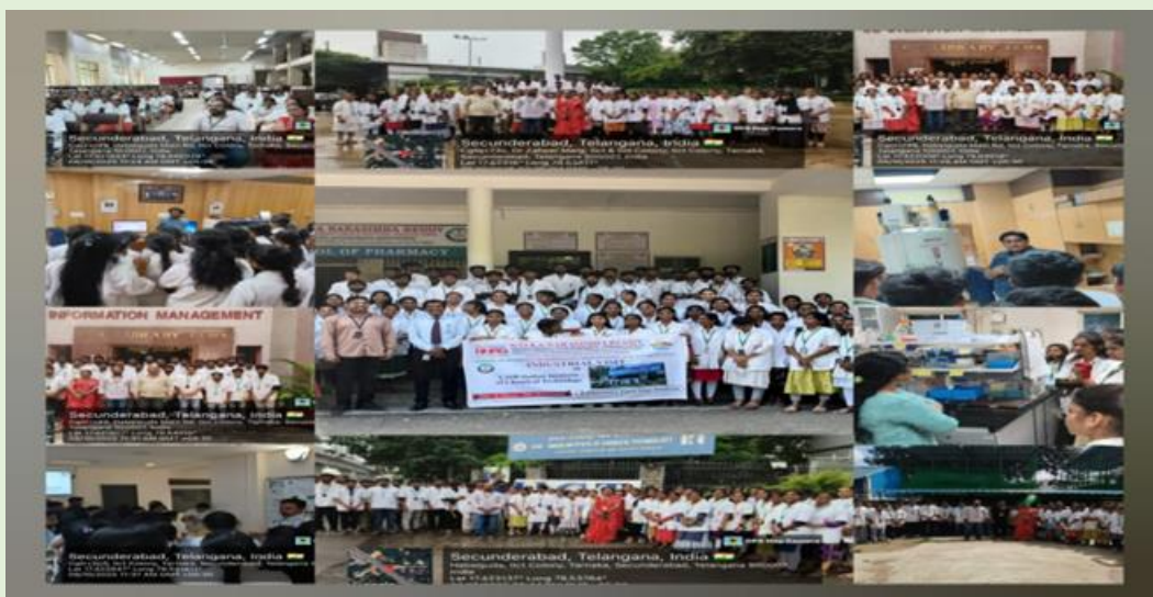
“Field visit and academic exposure activities enhancing practical knowledge and industry readiness among pharmacy students.”