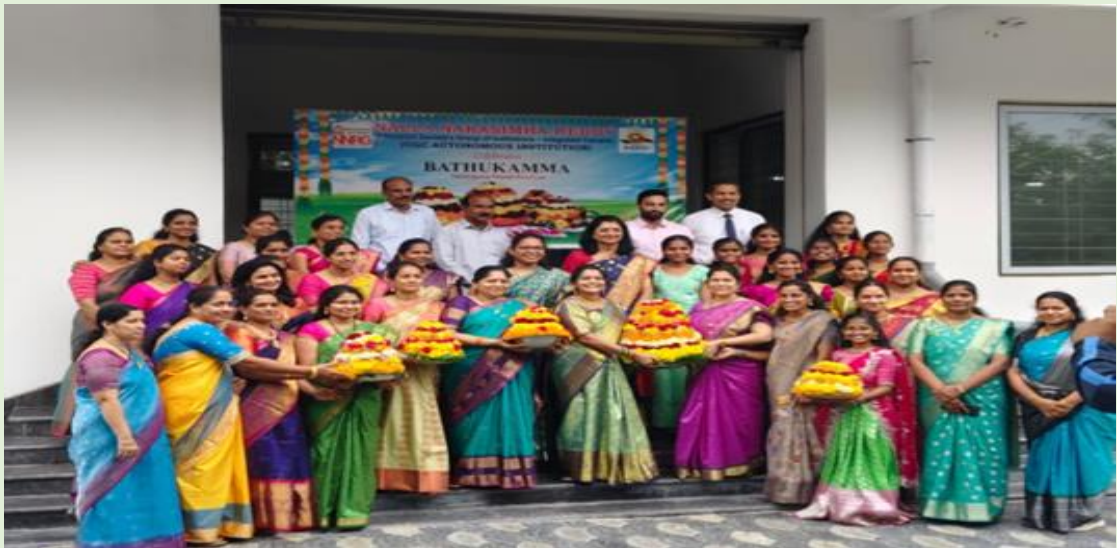
Bathukamma Celebrations at NNRG

and cultural clubs, the celebration ensured active student involvement and strengthened a sense of unity and cultural pride within the institution.