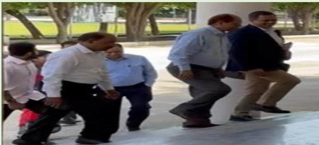
“NBA inspectors visiting the campus”