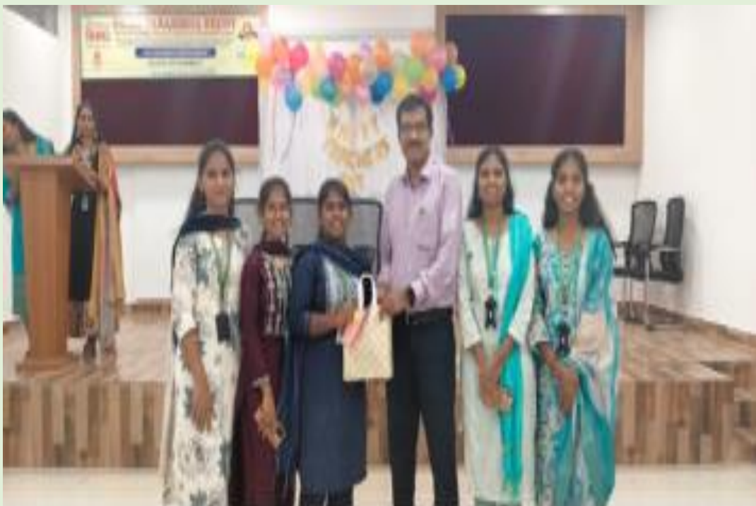
Teacher Day celebrations at NNRG

On 04.09.2025, students of Nalla Narasimha Reddy College celebrated Teachers' Day with great enthusiasm, honoring educators through cultural programs, speeches, felicitations, and heartfelt gestures that highlighted their vital role in shaping students' academic and personal growth while strengthening the student-teacher bond.