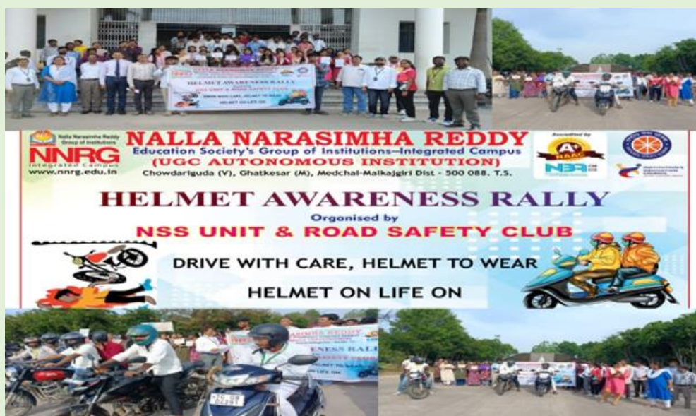
Helmet Awareness Day at NNRG

The awareness program was conducted on and around the NNRG campus and nearby public areas, attracting the attention of students, staff, and the general public. The event effectively conveyed the message of responsible driving and reinforced the significance of helmet use for personal safety.